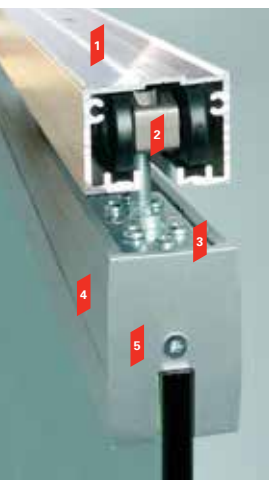
CS Frameless Glass clamp system with CS Pocket track, M8 carriage and mounting plate

Our engineers focus on constantly developing new products and refining existing ones. That's why our products come with a number of unique features: